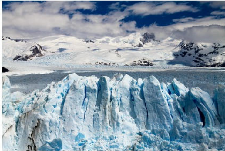
Figure 1: Glaciers nibbaaaa